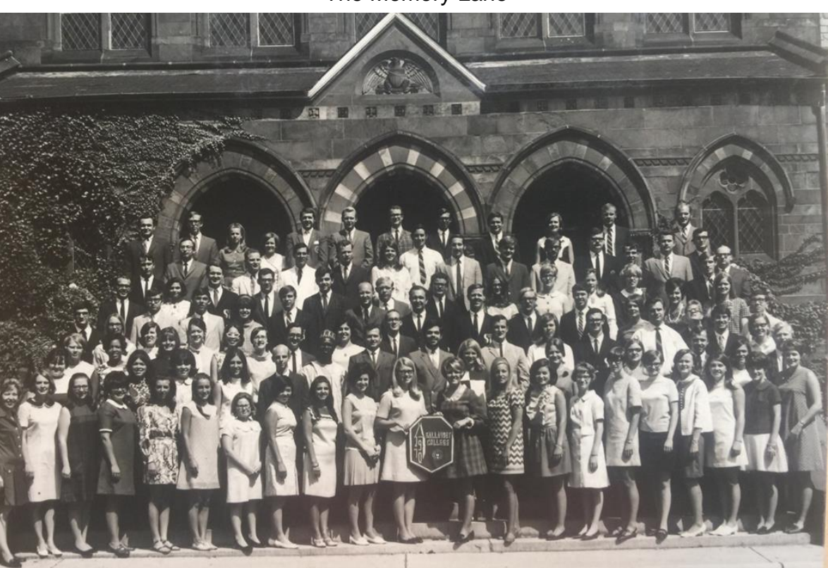
The Memory Lane

Our goal is to involve all class members in the decision about how to shape our endowment gift to Gallaudet. We hope you will all participate in deciding how the Class of 1970 will support Gallaudet forever.