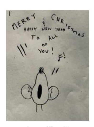
Issue No. 10

The next Issue No. 13 will be distributed in March.