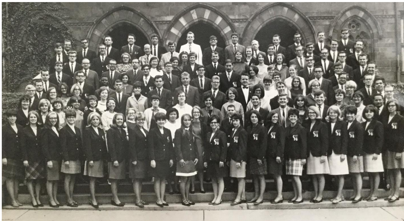
This photo was taken in our sophomore year (1967-1968).